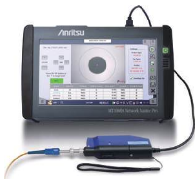
Available for MT1000A and MT1100A *Shown with MT1000A